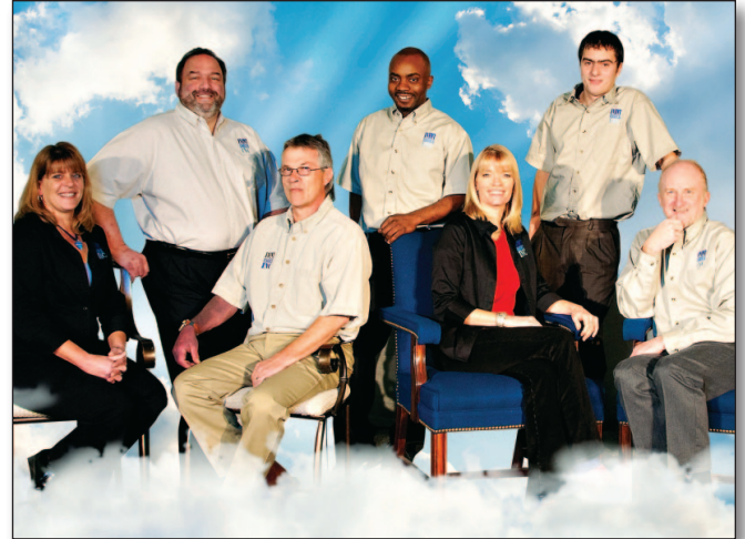
The Event Resources Team who makes you feel like you're on cloud nine.

Event Resources offers comprehensive event management and production solutions that leave lasting impressions. We provide behind-the-scenes logistical and technical support for a wide variety of events.